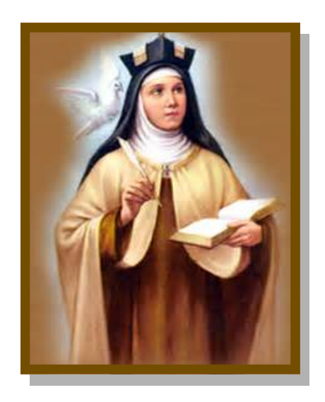
St. Teresa of Jesus