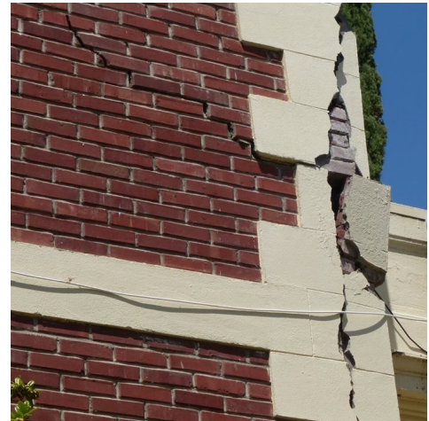
Outside of the building

On August 24 at 3:20 a.m. the Carmelite House of Prayer in Oakville was severely damaged by the 6.0 earthquake in Napa, twelve miles away. The original house