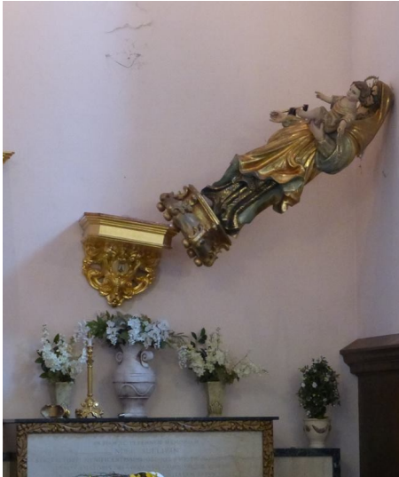
Our Lady of Mount Carmel statue in chapel, safely rescued the next day

individuals, have made retreats in this majestic setting. Two OCDS communities, Mary Mother of the Church and the Divine Infant Jesus, meet monthly at the House of Prayer. The Uganda Mission Office is also located there.