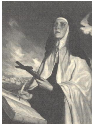
St. Teresa of Jesus

our best to attend daily Mass. Members frequently avail of the Sacrament of Reconciliation. We keep the fasting laws of the Church, and we fast on vigils of solemnities and major Carmelite feasts.