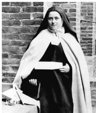
St. Thérèse of the Child Jesus and of the Holy Face

There have always been laypeople who have desired to share in the spiritual life of Carmel. Before Vatican II, these communities were called "Third Order." Now they are referred to as "Secular Order Discalced Carmelites," abbreviated as "OCDS."