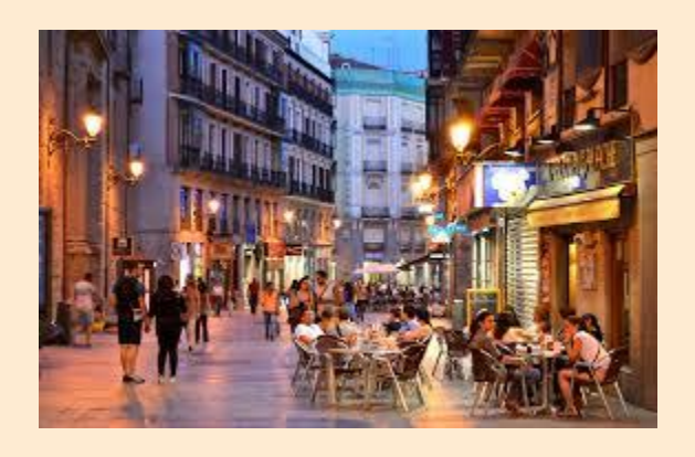
August 15- Saturday TOLEDO/MADRID (B)

Matins 7:30am - Morning Mass 8:00am - Breakfast 9am