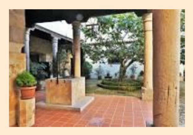
August 4- Tuesday (B) – SALAMANCA

Vespers 7:30pm, Dinner on your own- go eat Tapas at the Plaza Mayor