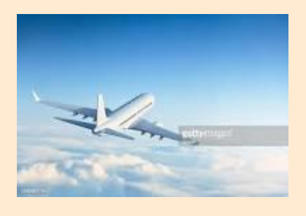
August 16- Sunday, DEPARTURE (l. D)

For those traveling home to the USA on this date, transport to the airport is covered, share ride