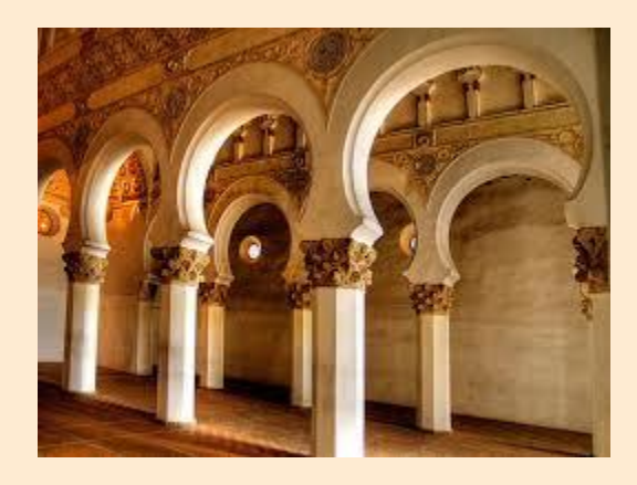
Matins 7:30 - Mass 8:00am - Breakfast 9am

Visit the Primatial Cathedral of Toledo 10:30