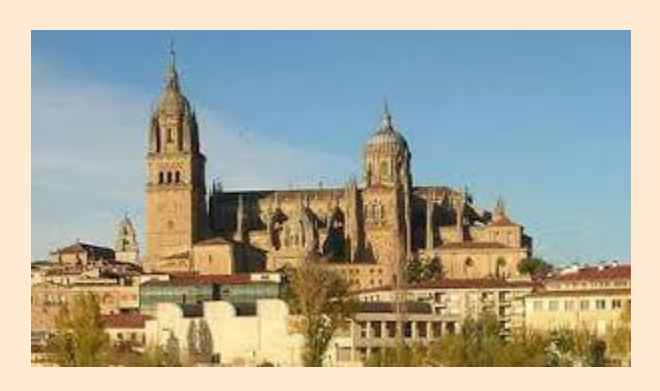
August 3 – Monday – SALAMANCA

Arrive at Madrid Airport/ Go to Salamanca by private coach Check-in, rest, Lunch on your own- nap or rest at the Plaza Mayor Afternoon Mass 6:30pm