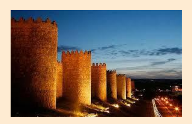
August 7 - Friday (B, L, D) - ALBA DE TORMES AND AVILA

SPECIAL DINNER 8:30pm at the Plaza Mayor ALL SHOULD BE THERE