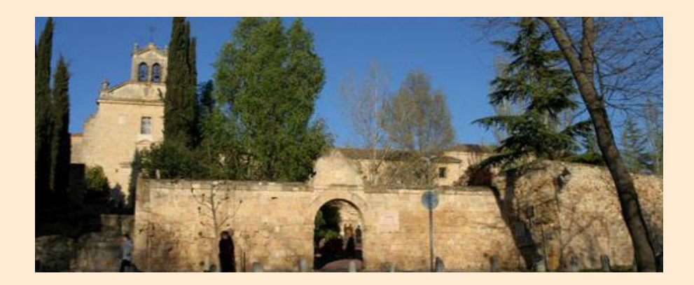
Matins 8:00am - Breakfast 9:00am