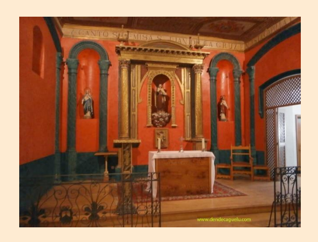
August 5- Wednesday (B) - MEDINA DEL CAMPO

Matins 7:30 - Breakfast 8am - Morning Mass, Carmelite Church, 10:00am Visit Casa de Teresa 11:00-12:30pm- where Teresa lived for three years Lunch 2pm- on your own San Esteban Dominican Monastery 4-6pm/Teresa's confessional and more Vespers 8:00pm - Dinner on your own