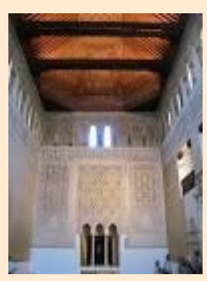
August 13- Thursday SEGOVIA/ TOLEDO (B, L, D)

Vespers 8:00pm - Dinner at the Center 9pm