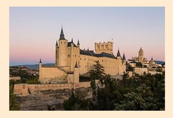
Matins 7:30am - Breakfast 8:00am

Morning Mass at the Monastery of San Juan de la Cruz - John's Sepulcher, 10am After Mass, Visit Templar's Church of the Vera Cruz, just around the corner Lunch at the Center 2pm