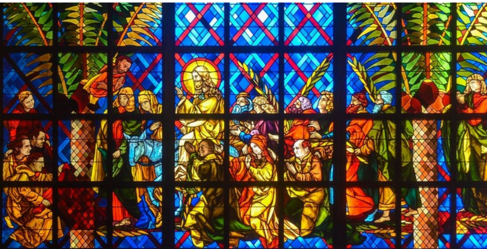
Basilique Notre-Dame de la Paix de Yamoussoukro